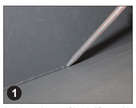
Apply a continuous ‰" bead of Protect-All Rapid Weld at the 90° transition where the Protect-All base sits on the floor.

Once the floor seams have been filled with the Protect-All Rapid Weld, installation of the Protect-All base and accessories can be completed.