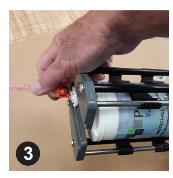
Install the mixing nozzle and secure with the previously removed cap.