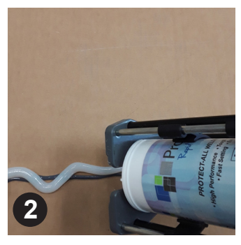
Using a piece of cardboard or scrap Protect-All, dispense the Protect-All Rapid Weld until Part A (white) and Part B (color) flow from the end.

a. Unscrew the end cap and remove the plastic insert.